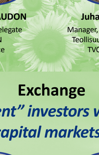
Christophe GRUDLER Member of the European Parliament