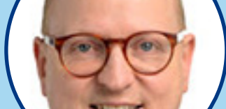
Bart GROOTHUIS Member of European Parliament, Netherlands

Investments in new nuclear capacities: including them in the taxonomy and recovery plans