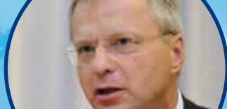
Jaroslav MIL Czech Government Commissioner for Nuclear Energy