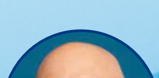
Michal KURTYKA Minister of Climate, Poland